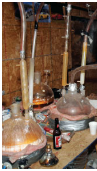
Methamphetamine labs are a local source of danger.

Production of methamphetamine is a growing problem. Meth is often produced in home labs. For every pound that's made, 5 to 6 pounds of toxic waste is left behind. People have become ill after moving into houses that were once meth labs.